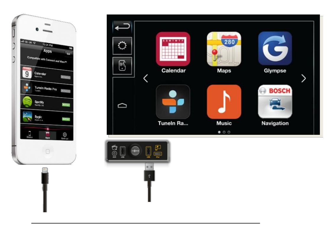
Fig. 1 – InControl<sup>™</sup> Apps Architecture (025PA)

InControl<sup>TM</sup> Apps, the first introduction uses leading in-car mobile technology to connect smartphone apps to the car's infotainment system, supported initially from Apple iPhone 5 onwards and compatible Android devices (minimum v4.0 - not all devices will be officially supported). Key apps such as Contact, Maps, Calendar and the Music player work out of the box and a stream of locally approved apps will be released over time to ensure a constantly fresh and relevant user experience.