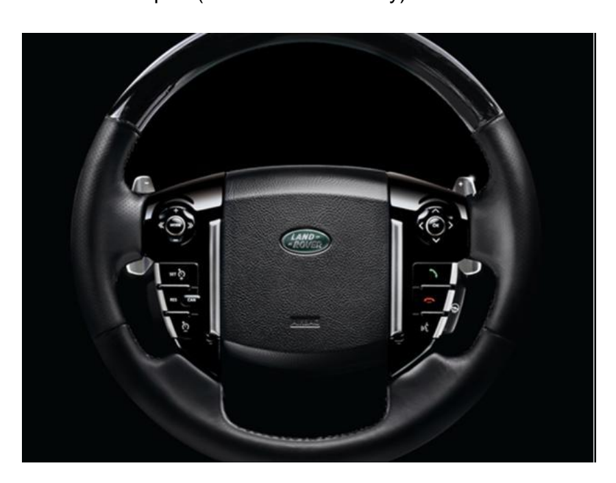
Fig. 4 - Grand Black Lacquer Wood/Leather Steering Wheel (032DR)

A wood/leather steering wheel first seen on the XXV LE will be available to order on 15MY vehicles fitted with Grand Black Lacquer (HSE / HSE Lux only).