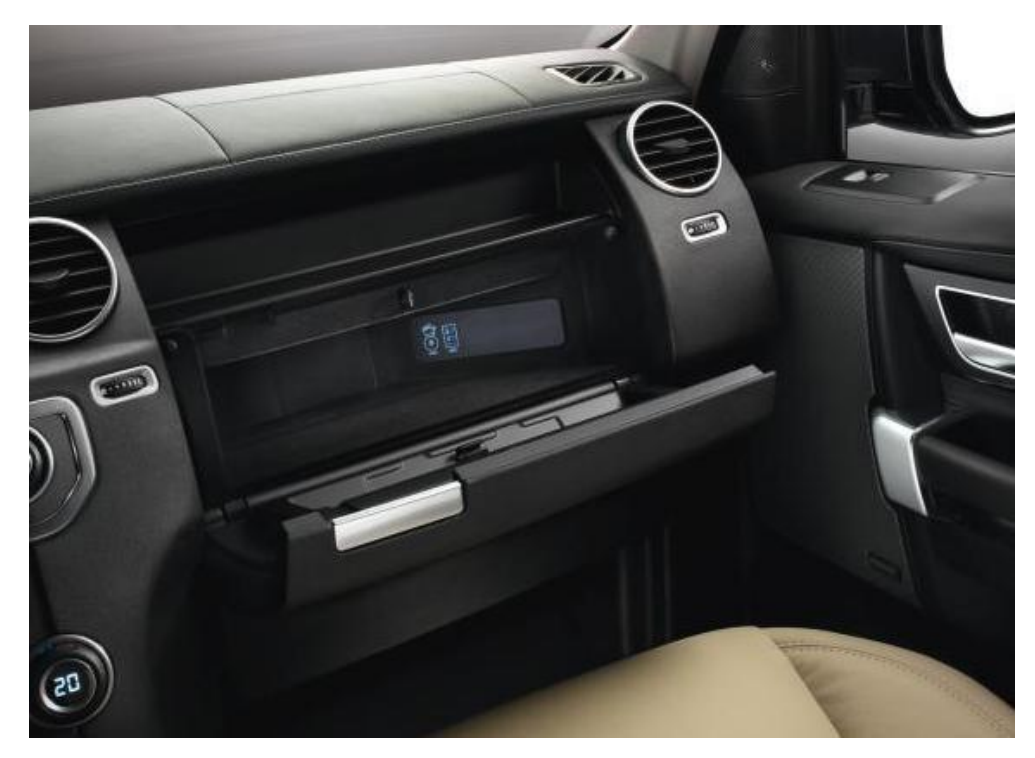
Fig. 3 – Audio Interface Panel in Glovebox (Aux-in, audio USB and InControl<sup>™</sup> Apps connections where fitted)