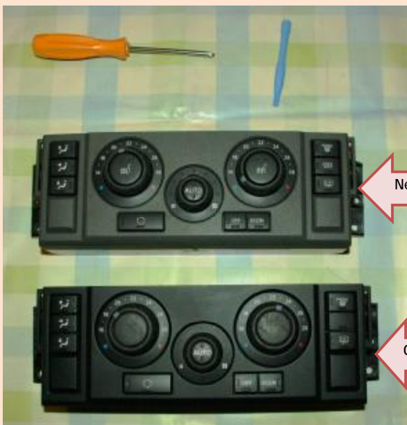
New unit (grey)