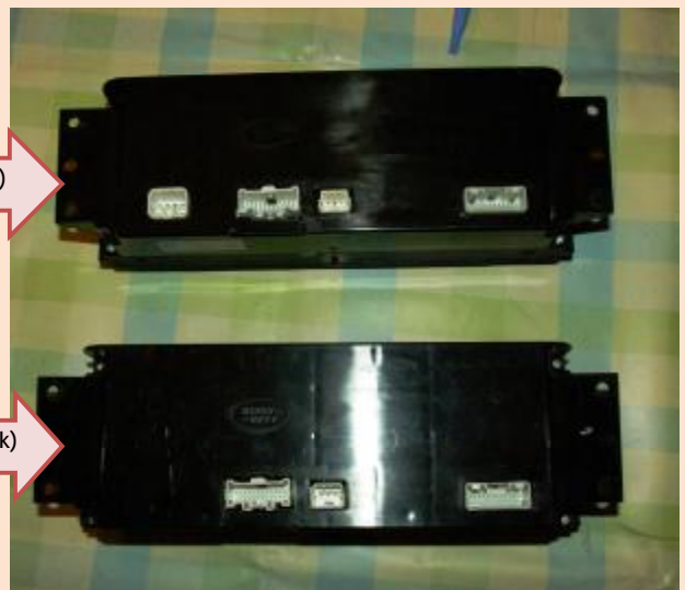
Old unit (black)