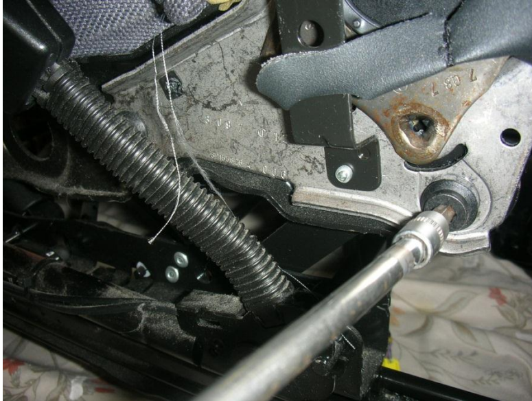
Seat back removed

The left-hand side is the same but you just need to access one of the bolts by pulling the plastic cover away from the seat base to get your socket on it.